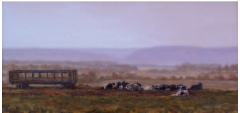
ABOVE After the Morning Feeding by Karl Leitzel, 2008, oil, 15 x 30. Collection the artist.